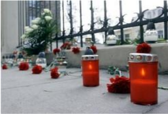
Moment of silence 11:00 a.m. Remembering Minsk April 2011.

2010, presidential elections and the subsequent repressions of any opponent of the current regime created a very confusing time for these Belarusian students.